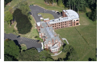
Mountain Villa School