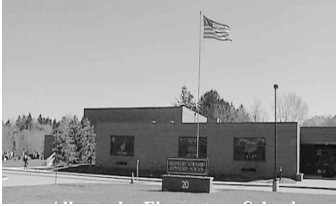
Allamuchy Township School